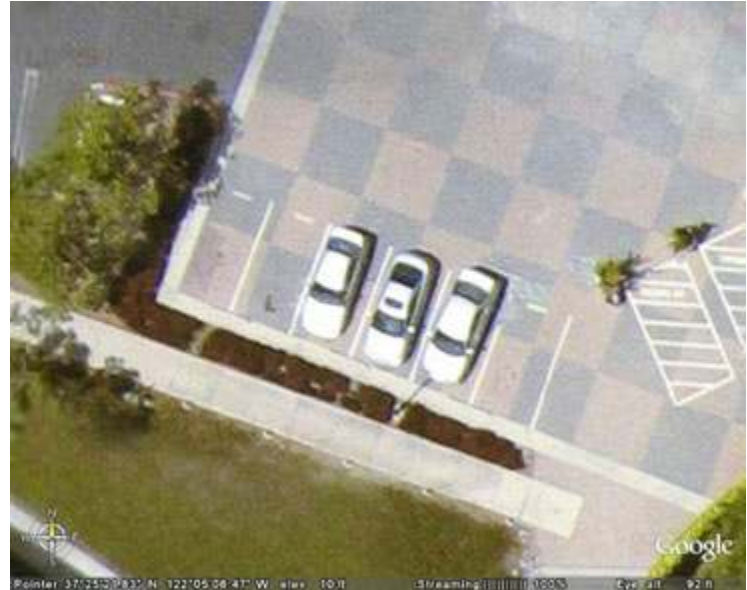
High-resolution image of cars on the Google Campus.

Most of the earth is low resolution imagery, but some places, such as major metropolitan areas, offer much higher resolution.